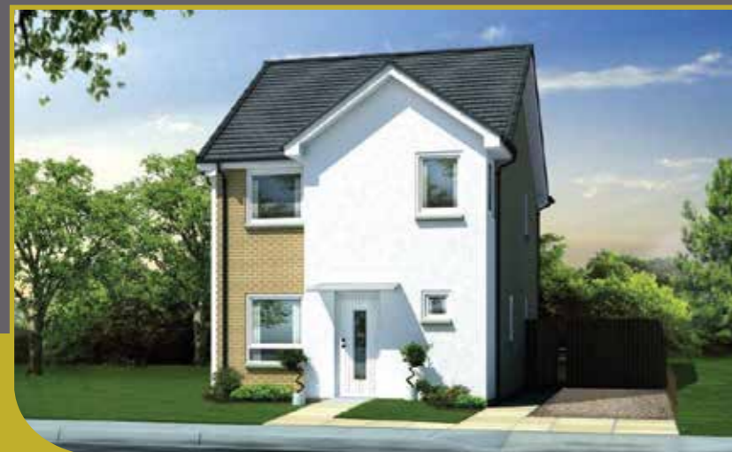
The Bruce, a spacious three bedroom family home with fitted kitchen/dining, lounge, downstairs shower-room and family bathroom.