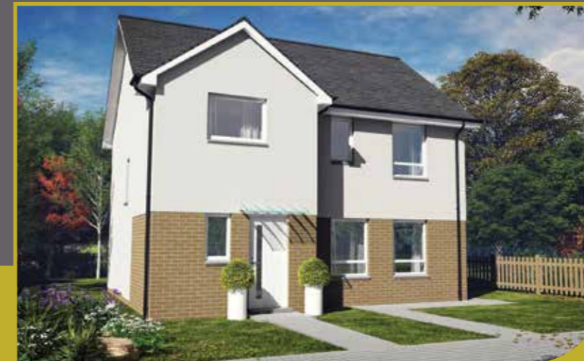
The Lewis, a spacious four bedroom family home with fitted dining kitchen/ family room, lounge, en suite and family bathroom.